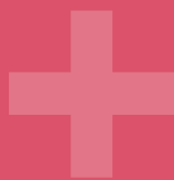
Ethical Hack Bot